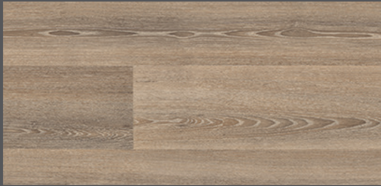
ROASTED LIMED ASH