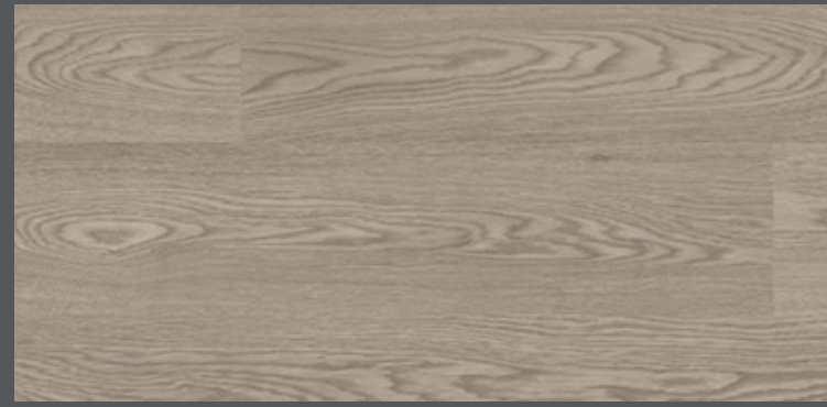
SUN BLEACHED OAK