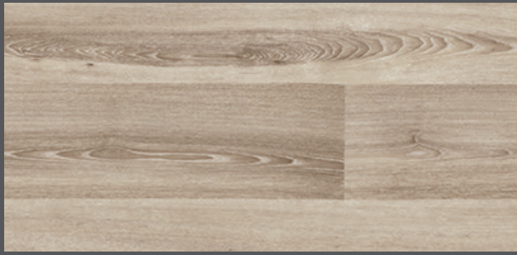
HONEY LIMED ASH